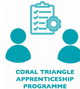
CORAL TRIANGLE APPRENTICESHIP PROGRAMME