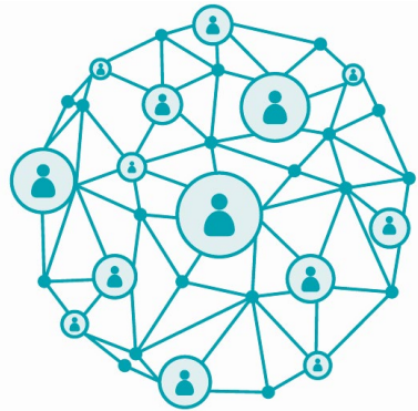
REGIONAL TRAINING NODE DEVELOPMENT