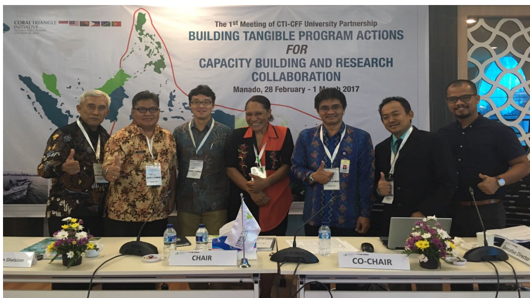
Figure 4. The Group C, tasked to discuss the Potential Collaboration and Support on Outreach Programs