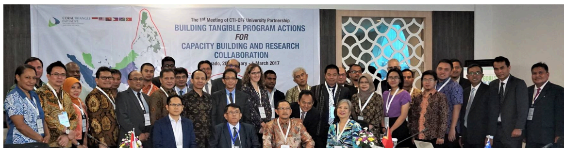
Figure 2. Group Photo of the 1 st Meeting of CTI-CFF University Partnership

The CTI-CFF Regional Secretariat hosted the 1 st Meeting of CTI-CFF University Partnership, hereinafter referred to as the "Meeting", on 28 February – 1 March 2017 at the CTI-CFF Headquarters in Manado, Indonesia. Delegates from the National Coordinating Committees (NCCs) of CTI-CFF Member States, representatives from Member of CTI-CFF University Partnership and observers attended the Meeting. The full list of participants is attached as in Annex I .