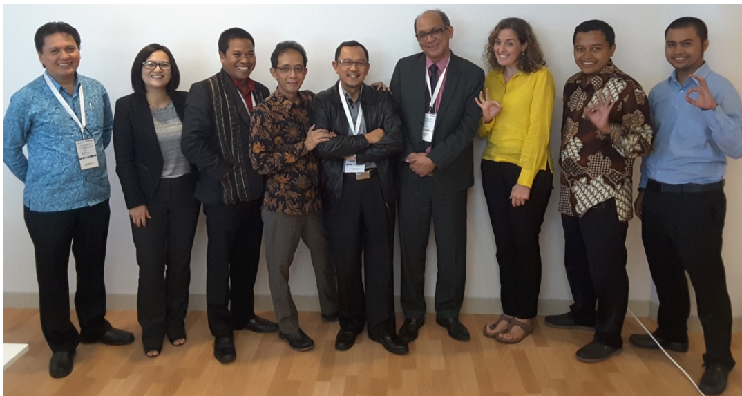
Figure 3. The Group A, tasked to discuss the Potential Collaboration and Support on Capacity Building

The proposed programs/actions on capacity building include academic collaboration and regional training. The academic collaboration will be focused on establishment of an international M.Sc. Subject on Coral Triangle Ecosystem Governance, and special assistance program for Timor-Leste in developing fisheries and marine sciences education. While, the regional training program will focus on the public engagement for Coral Triangle, and program and project management for Coral Triangle.