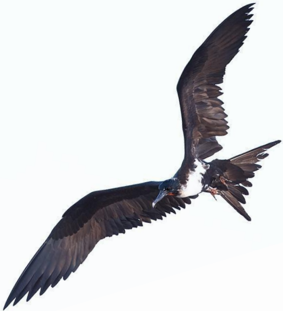
CHRISTMAS FRIGATEBIRD - CMS I