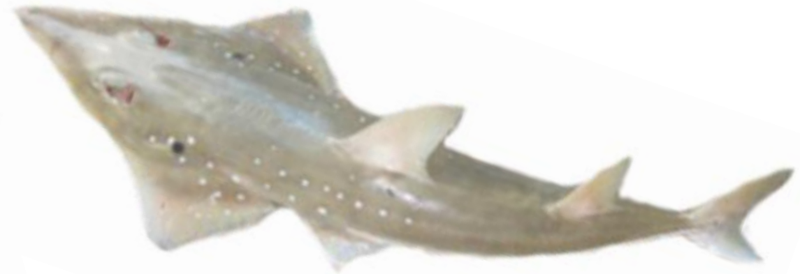
WHITE-SPOTTED WEDGEFISH- CMS II