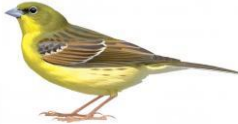
YELLOW BUNTING - CMS II