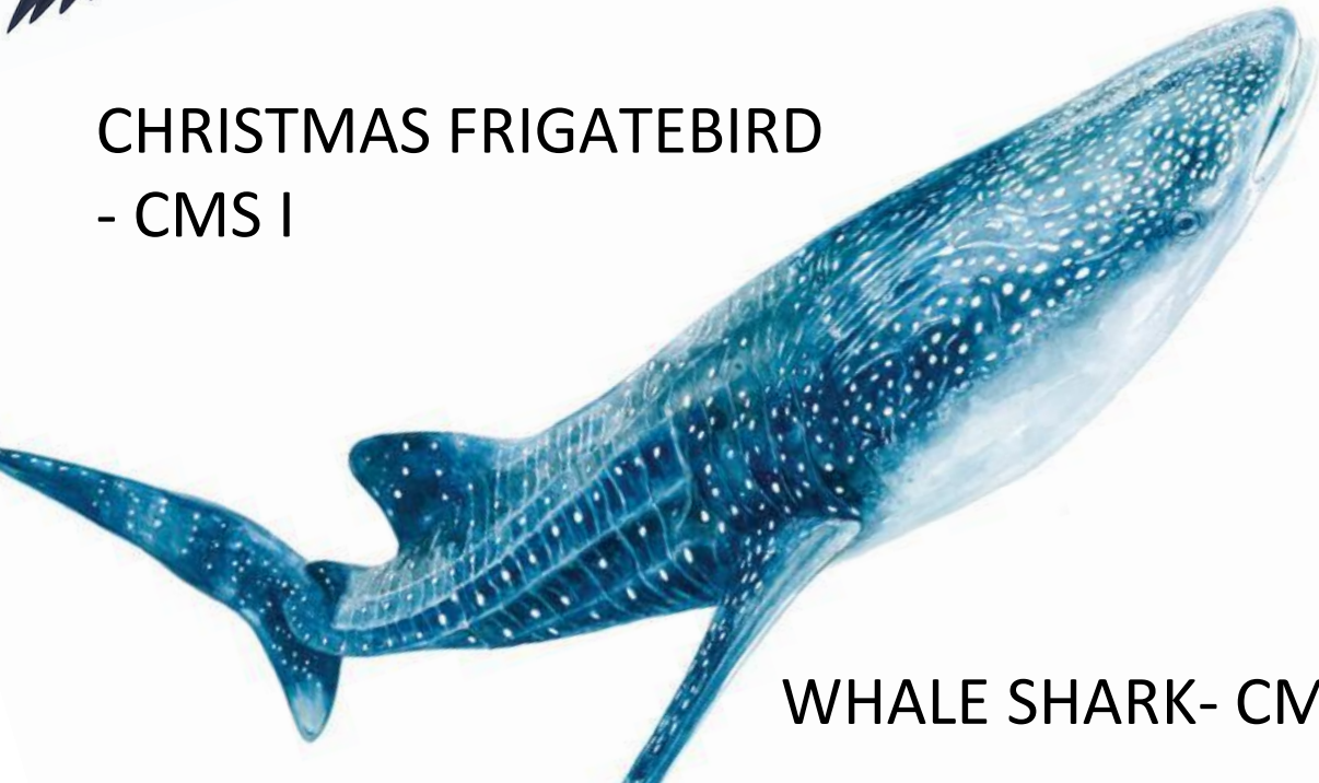
WHALE SHARK- CMS I