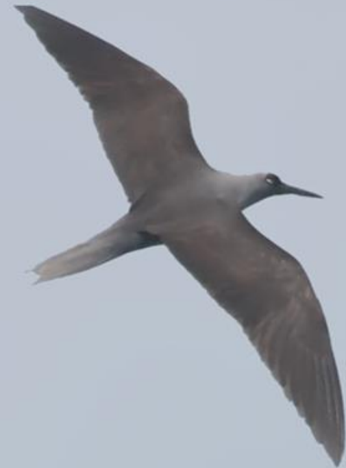
BLACK NODDY - CMS II