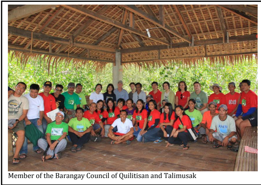
Member of the Barangay Council of Quilitisan and Talimusak

education, these are as follows: 1) Planting mangroves; 2) Tidal walk with interpretation; 3) Kite flying demo and production; 4) Gleaning demonstration; 5) Kayaking or boating; 6) “De Layag” boating; 7) Snorkeling; 8) Glass bottom boat tours; 9) Bird watching; 10) Sunset viewing