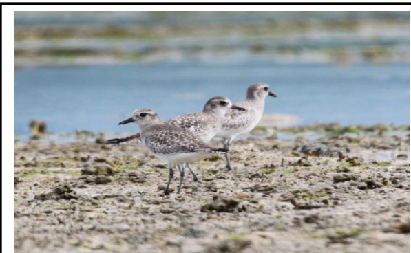
Rufous-Necked Stint non breeding found in Ang Pulo

The four (4) hectares overwashed mangroves at the Polo Island is located between 120° 36' 56.48" longitude and 13° 53' 14.1" latitude. Mangrove species growing on sandy/coralline substrate include Rhizophora stylosa , Avicennia marina and Sonneratia alba as the dominant species. Mangrove associates are represented by Morinda citrifolia , Pongamia pinnata and Acacia farnesiana .