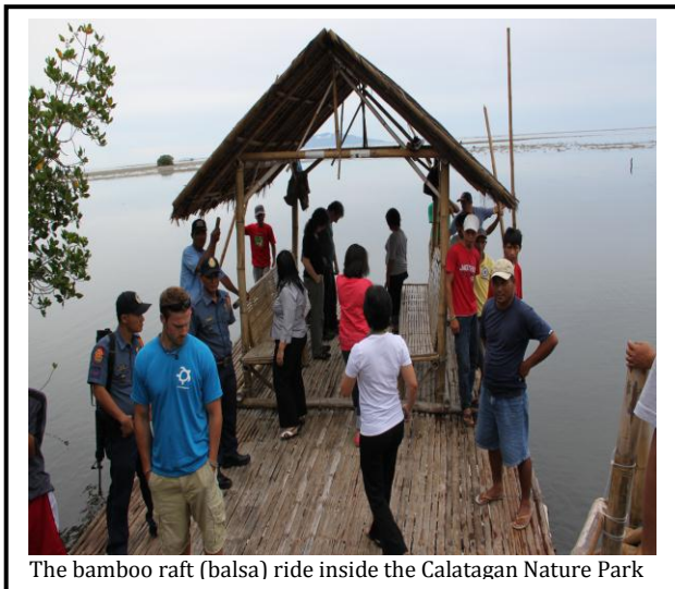
The bamboo raft (balsa) ride inside the Calatagan Nature Park

The remaining mangrove areas are classified into fringing and overwashed types of mangrove forest. The fringing mangrove is situated between 120° 36' 58.2" longitude and 13° 53' 0.9" latitude with an aggregate area of thirteen (13) hectares dominated by Avicennia marina , Avicennia alba and Rhizophora stylosa . The substrates are characterized by muddy at the seaward zone and clayloam at the middle extending to the landward zone. Few regenerations of A. marina and A. alba was observed at the landward zone of the mangrove.