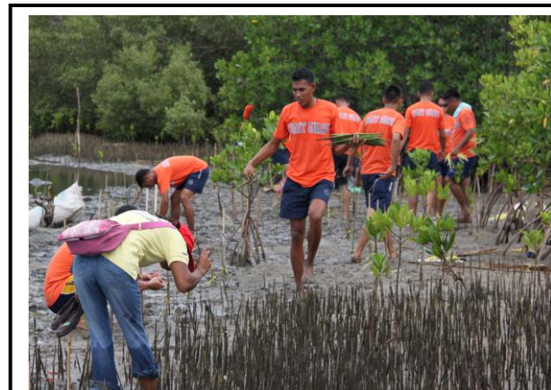
The 200 Philippine Coast Guards Planting mangroves during the Joint Mangrove Rehabilitation of Ang Pulo

A joint mangrove rehabilitation project was launched last 25 June 2010 with the Philippine Coast Guard, Provincial Government of Batangas, Municipal Government of Calatagan, Batangas, USAID and Conservation International-Philippines. The rehabilitation was aimed at restoring a 5,000sqm of mangrove forest in Ang Pulo.