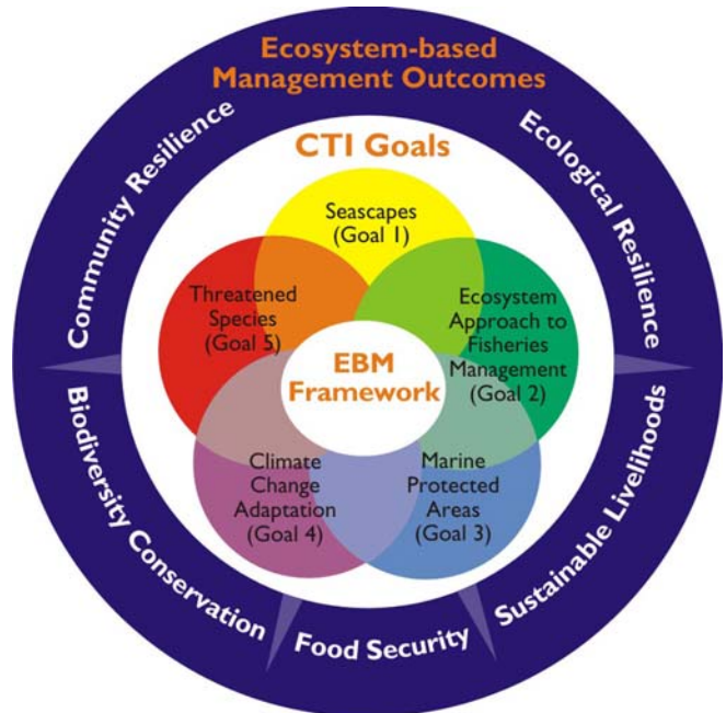
Alignment of the five CTI-CFF goals and ecosystem-based management (EBM) outcomes through an EBM Framework.

The Integration Guide also contains the aligned glossary of common terms and a description of each of the tools in the Integrated Toolkit.