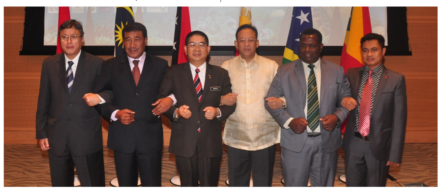
"As Chair of the CTI-COM, I strongly urge member countries to take necessary steps to accelerate the signing and ratification of the Agreement on the Establishment of the CTI-CFF Permanent Regional Secretariat."

In this regard, I am pleased to announce that Malaysia has ratified and deposited the instrument of ratification to the Government of the Republic of Indonesia. As Chair of the CTI-COM, I strongly urge member countries to take necessary steps to accelerate the signing and ratification of the Agreement on the Establishment of the CTI-CFF Permanent Regional Secretariat. I sincerely hope we can finalise the ratification process by mid-2013. The future of our ocean depends on our capacity to make progress in goals that we have identified and agreed upon together.