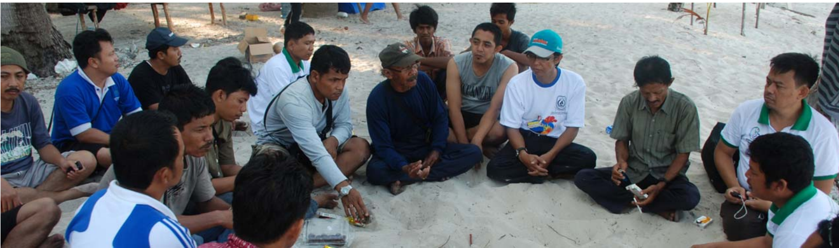
MPA MANAGEMENT PRACTITIONERS AND STAKEHOLDERS DISCUSS NO-TAKE ZONES AND TURTLE MANAGEMENT IN ANAMBAS, INDONESIA