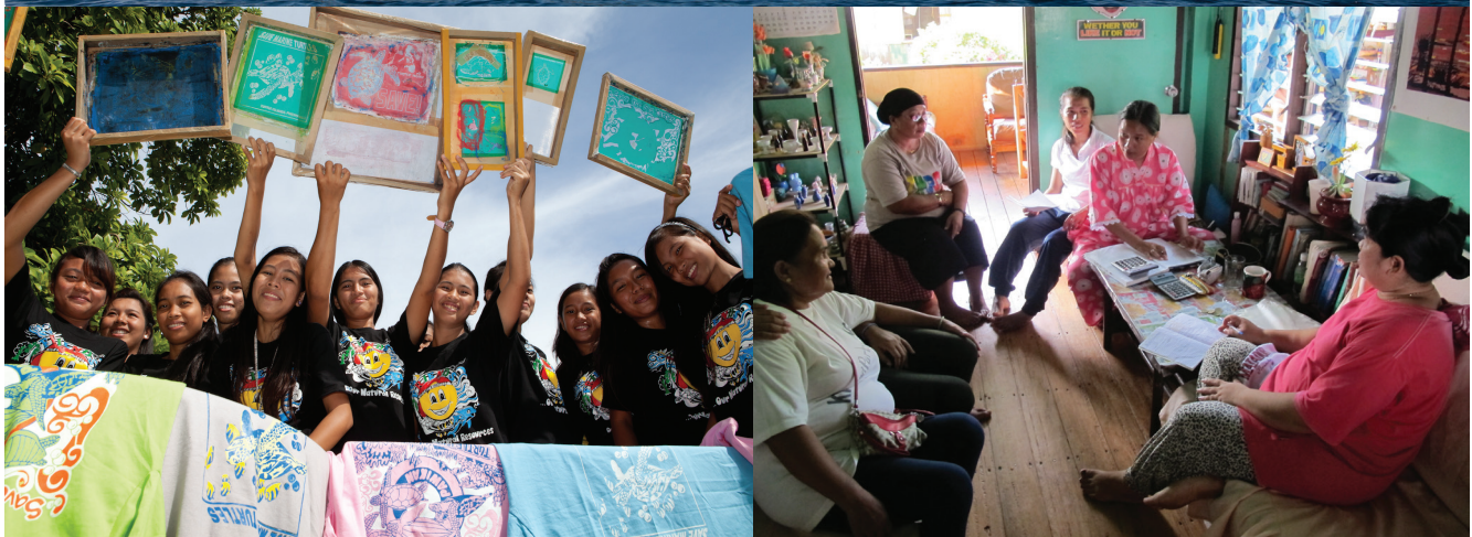
Top: Lihiman Island, TIWS